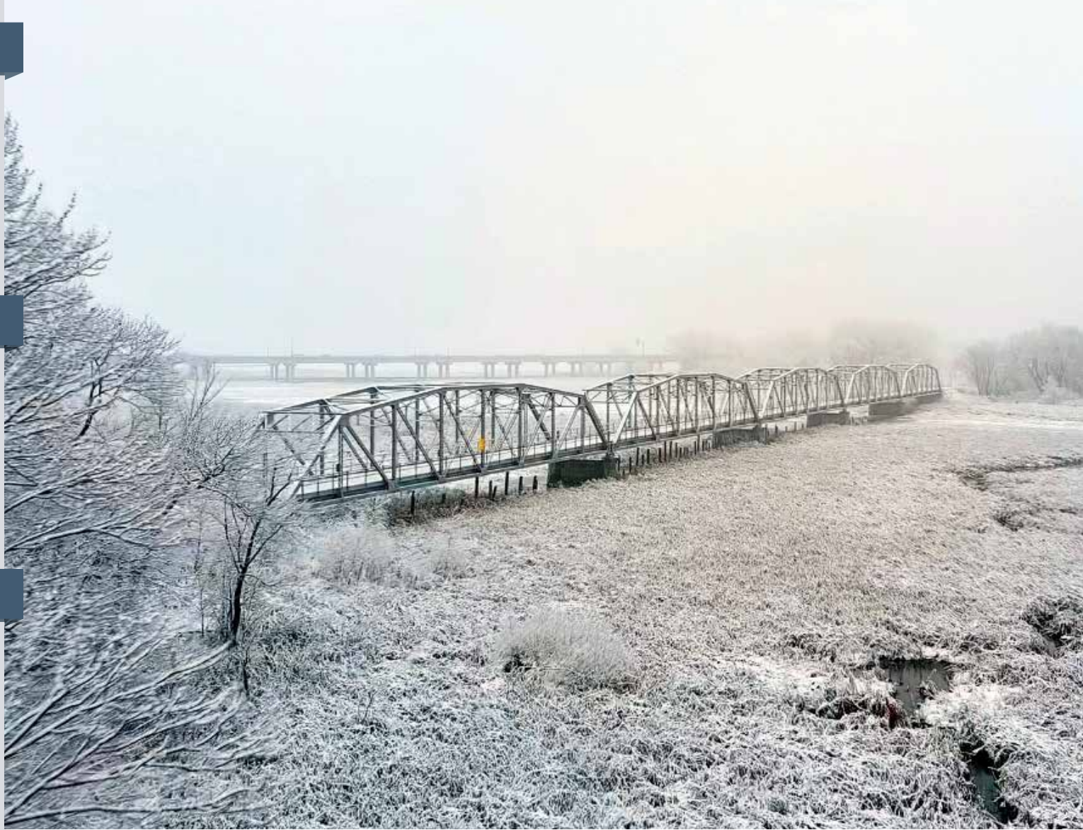
Old Cedar Avenue bridge is a beautiful place to walk and enjoy nature no matter the season.