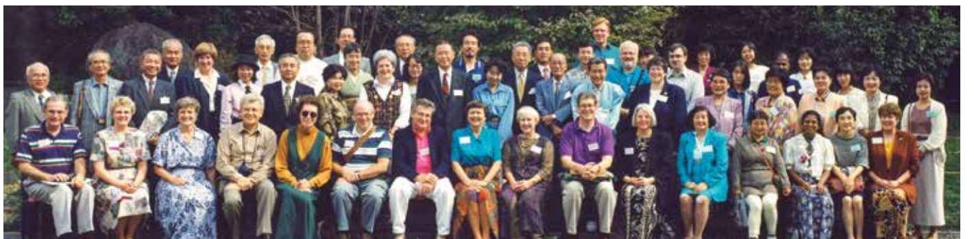
The 1995 sister city delegation meets in Bloomington.